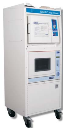
Fully equipped Tower